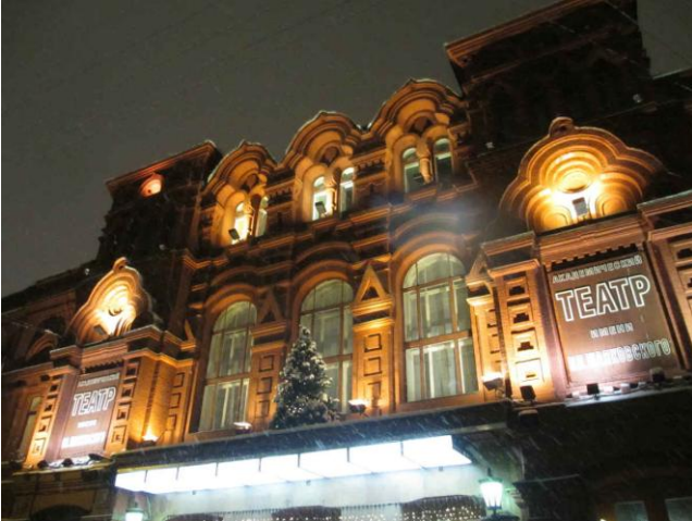
Okhlopkov Drama Theatre

In the morning you will arrive in Irkutsk, the capital of Eastern Siberia in tsarist times, move into your centrally located hotel. You can safely leave your large baggage on the private train. Your city tour includes the Okhlopkov Drama Theatre , the new memorial to Tsar Alexander III, and the photogenic Market Hall . Around noon you pay a worthwhile visit to an open-air museum with a focus on life and work in historical Siberia.