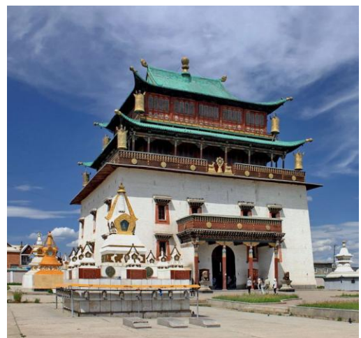
Gandan Buddhist Monastery

Overnight on board; breakfast, lunch and dinner included.