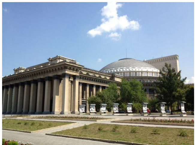
The Opera House

Overnight on board; breakfast, lunch and dinner included.