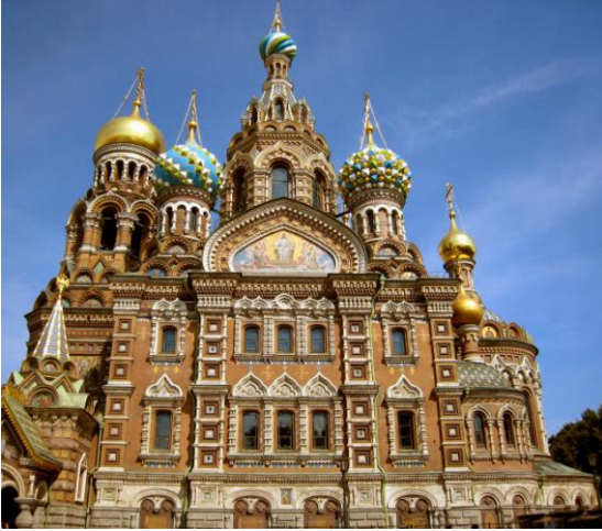
Cathedral of the Saviour on Spilled Blood

Your train stops in the afternoon in Yekaterinburg, the capital of the Ural Federal District. The city is known as the place where the Russian tsar Nicholas II and his family were murdered in 1918.