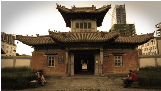
Gandan Buddhist Monastery